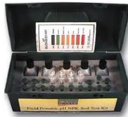
Insulation tester Multi meter tester Acidity Testing Kit