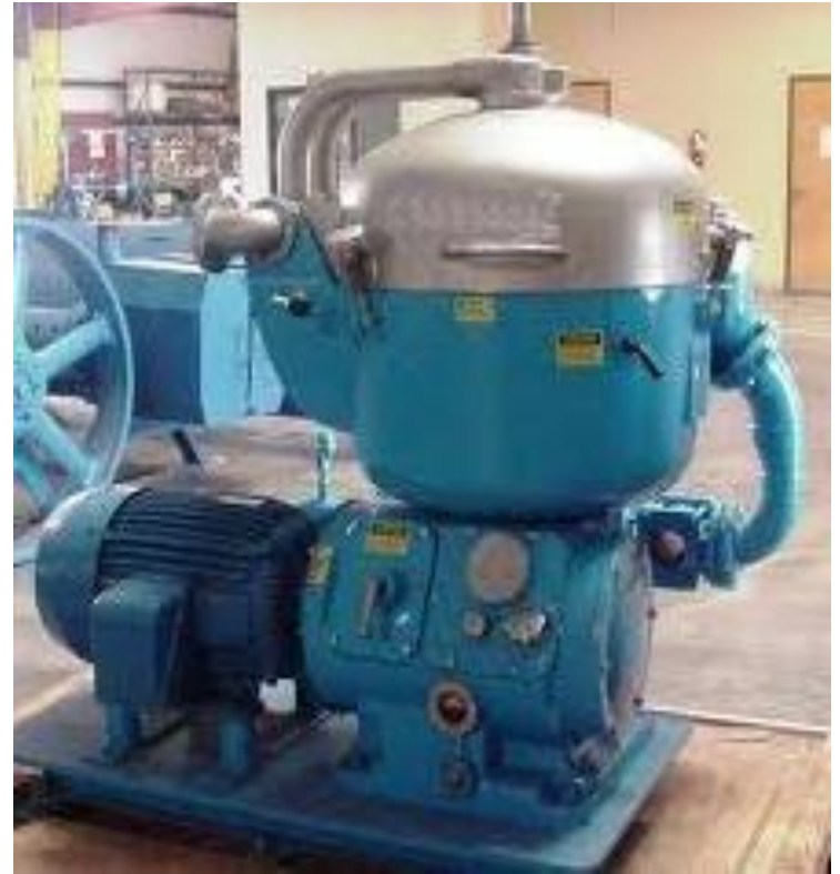
Transformer Oil Filter Machine Hydraulic Oil Filter Machine TESTING EQUIPMENT