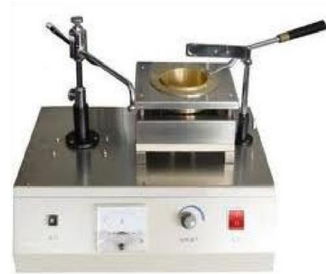
Transformer Oil Testing Kit Clamp Meter Earth Tester Flash Point Testing Kit